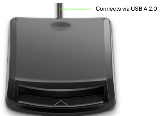
Top profile: F1DN008U and F1DN088Utt