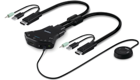
F1DN102N-3 (DP to HDMI)