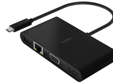
Connect USB-C 5-in-1 Hub Plus 100W AVC004BK-BL