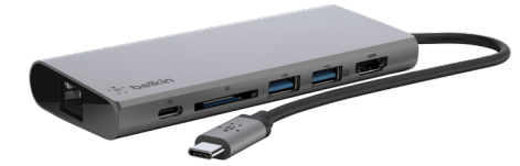
Connect USB-C 6-in-1 Multimedia Hub F4U092btSGY