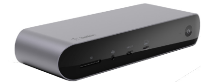
Connect Pro Thunderbolt 4 Dock INC006ttSGY