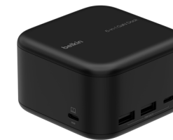
Connect USB-C 6-in-1 Core GaN Dock 130W INC018ttBK