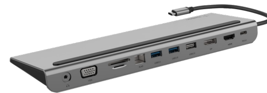
Connect USB-C 11-in-1 Multiport Dock INC004btSGY

All docking stations running Belkin Dock Utility Software support Windows OS.