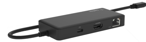
Connect USB-C 5-in-1 Multiport Adapter INC008ttBK

See more on the Belkin Dock Utility site: belkin.com/DockUtilitySoftware