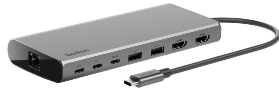
Connect Universal USB-C 8-in-1 Dual Display Hub INC015btSGY

All hubs and adapters running Belkin Dock Utility Software support Windows OS.