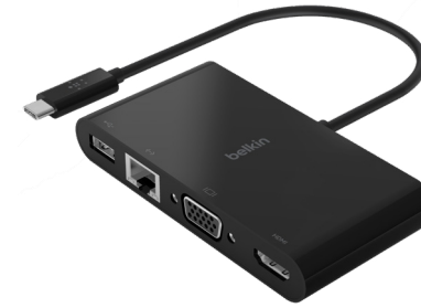
Connect USB-C 4-in-1 Core Hub AVC005BK-BL