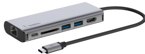
Connect USB-C 6-in-1 Multiport Adapter AVC008btSGY