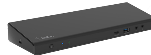
Connect Universal USB-C Triple Display Dock INC007ttBK