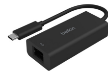
Connect USB-C to 2.5Gb Ethernet Adapter INC012btBK