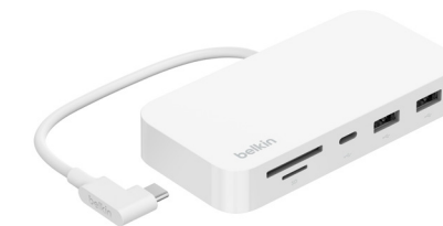
Connect USB-C 6-in-1 Multiport Hub with Mount INC011ttWH