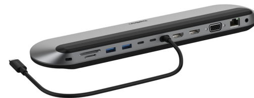
Connect Universal USB-C 11-in-1 Pro Dock INC014btSGY