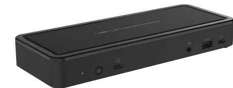
Connect 14-Port USB-C Docking Station, 65W INC003ttBK

See more on the Belkin Dock Utility site: belkin.com/DockUtilitySoftware