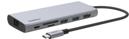
Connect USB-C 7-in-1 Multimedia Hub INC009btSGY